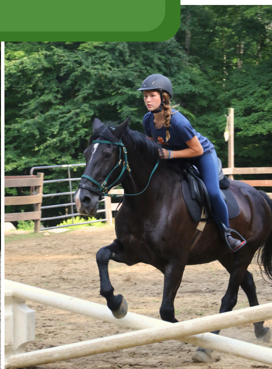
Christian Summer Camp for Girls Adirondacks NY